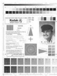
Kodak TL 5003