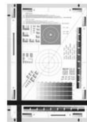
(See ISO 12653)

*EPM is neither recommending against or for any particular vendor