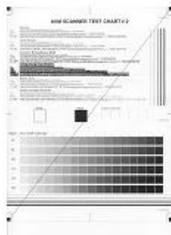
(See ANSI/AIIM MS 44)